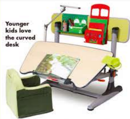
Younger kids love the curved desk

'EVEN FROM THE AGE OF THREE YEARS OLD, IT'S IMPORTANT TO OFFER CHILDREN AN EDUCATIONAL ENVIRONMENT'